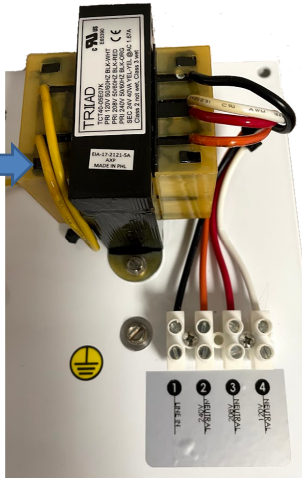
Substitute Transformer PN 4510157