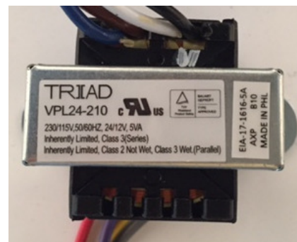
Substitute Transformer PN VPL24-210

Note wire colors are affected as shown below when the Triad VPL24-210 transformer is used: